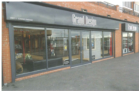
ABOVE: The new showroom has been incredibly popular with trade customers and consumers. It is packed full of the latest innovative aluminium products.

Open since January 2013, the showroom is located on the Eastern Parade on the seafront of Canvey Island. It is unlike your usual showroom, in that it serves to showcase many of the products on offer, but isn't there to force customers into signing on the dotted line. Managing Director at Duration is Grant Chelton, the driving force behind the impressive support that Duration gives to its customers. Grant told Windows Active: "The showroom is instrumental in showcasing all our products. Firstly, it enables us to drum up demand for our customers. Consumers want to see and feel the products and a trip to our factory wasn't really appropriate. Our appetite for demonstrating products really came from our regular appearances at the Grand Design exhibitions. Homeowners come from all over the